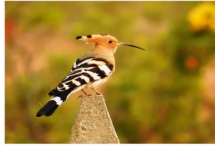
हुद-हुद किंवा हुपो (Hoopoe)

Meetings were held through zoom app with VRDC Centres located at various regions to maintain Communication with local teachers and Review of Ground level conditions.